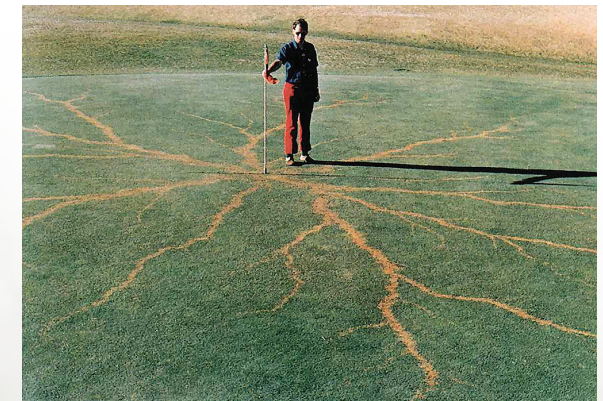
Krinder's, Golf Green.

For more information, visit www.weather.gov/lightning