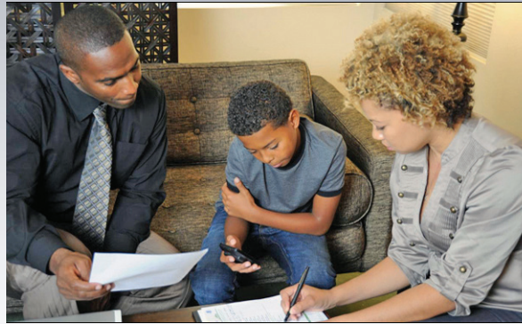
Sit down with your family or friends and develop a communications plan.

Finally, some victims were struck inside homes or buildings while they were using electrical equipment or corded phones. Others were in contact with plumbing, a metal door or a window frame. Avoid contact with these electrical conductors when a thunderstorm is nearby!